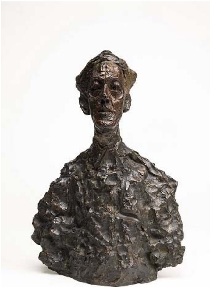
Alberto Giacometti, Yanaihana I , 1960-61 The National Museum of Art, Osaka, Photo: Kazuo Fukunaga