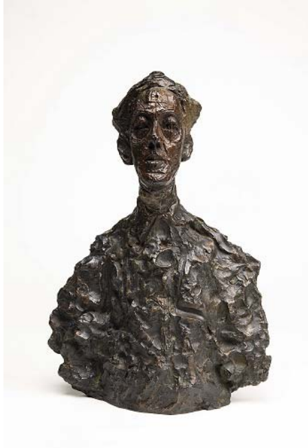
Alberto Giacometti, Yanaihara I , 1960-61 The National Museum of Art, Osaka