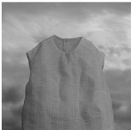
Yuki Onodera, Portrait of Second-hand Clothes No.45 , 1997 The National Museum of Art, Osaka © Yuki Onodera