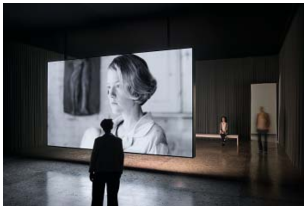
Teresa Hubbard / Alexander Birchler, Flora , 2017, The National Museum of Art, Osaka 57th VENICE BIENNIAL, SWISS PAVILION 2017 Installation View Courtesy the Artists, Tanya Bonakdar Gallery, New York / Los Angeles and Lora Reynolds Gallery, Austin Photo Credit: Ugo Carmeni