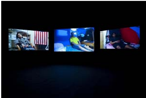
Chia-En Jao, REM Sleep , 2011 The National Museum of Art, Osaka © Chia-En Jao

NMAO collection with Alberto Giacometti II