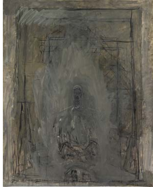
Alberto Giacometti, Homme , 1956 The National Museum of Art, Osaka