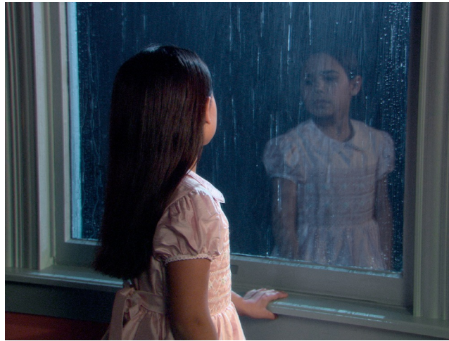
Still from Eight, 2001. High definition video with sound, 3 minutes, 25 seconds, loop.