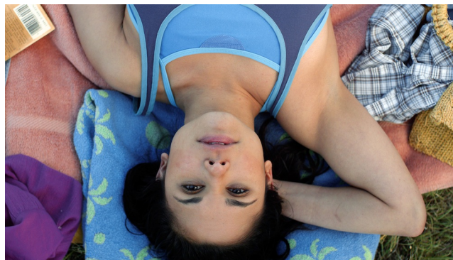
Still from Eighteen, 2013. UHD video with sound, 18 minutes, 30 seconds, loop.