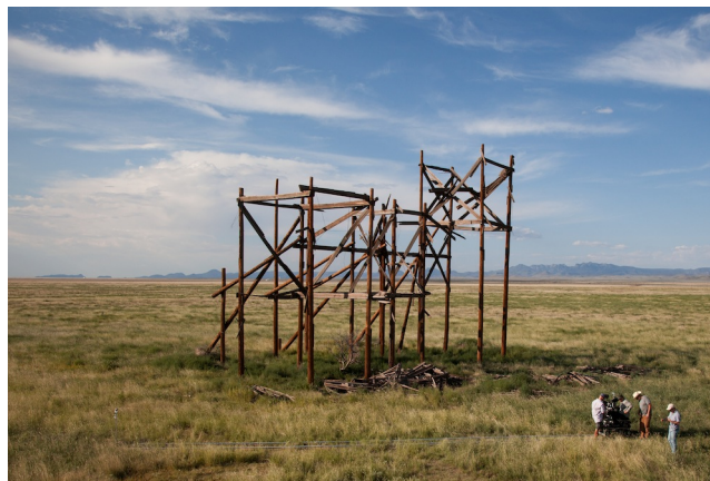
Production still from Giant, 2014.